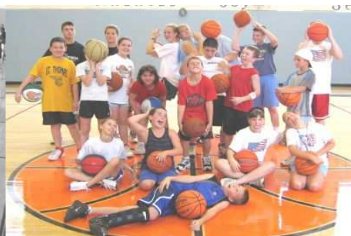
State champs— NO, Having fun—YES!