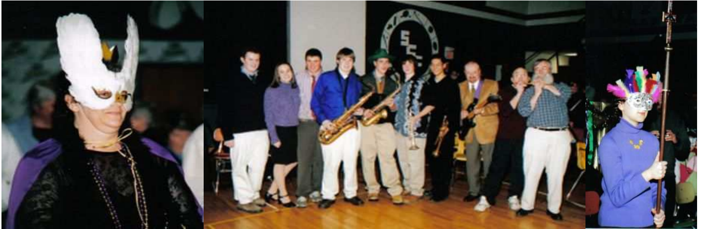
Over 200 students, family members and friends attended our Mardi Gras Mass in February. Do you recognize any of the above revelers?