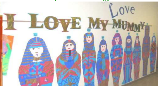
Happy Mother's Day from St. James students