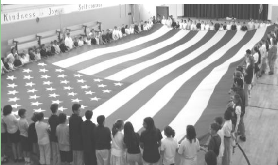
Patriotic exercises are part of the lesson at St. James